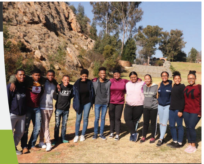
Scholarship recipients recently attended a workshop, to equip them for work life.

The workshops were attended by six students from Umoya Energy Wind Farm's Scholarship Programme. The students shared their appreciation for the opportunity to attend the workshops and were excited by the valuable tools they were exposed to.