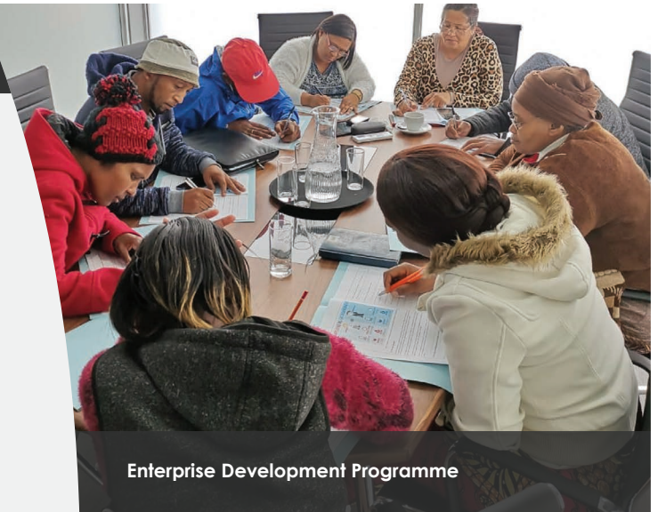
Enterprise Development Programme

There are currently 10 businesses from the local community participating in the programme. These SMMEs include: Shalom Baking, Leej, T Maqolo Trading, Malihambe Project Primary Co-Operative Limited, Mzamomhle Car Wash and Cleaning, Thembelakuye Trading (Pty) Ltd, HOD Enterprise, Lukanyo Lwethu Technologies (Pty) Ltd, Qhzwekazi Designs and TA SK Installers.