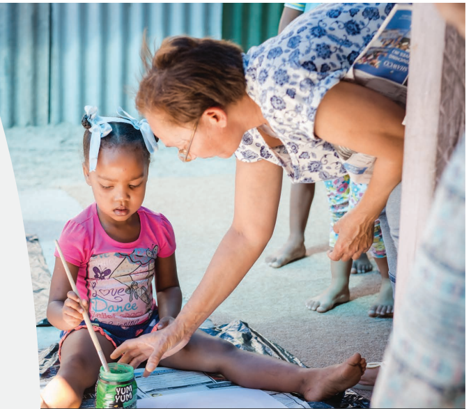
Playgroups Leaders received further training in Hopefield, to help children grow in confidence and become school ready.

Programmes include: Bridging the Gap: NCF (National Curriculum Framework) and CAPS (National Curriculum and Assessment Policy Statement) and making of Early Childhood Development resources for ASB (Assessment for School Beginners).