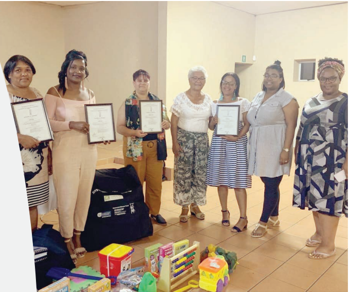
Playgroup Mentors & Coaches were awarded certificates at the community meeting.

We're pleased to announce that Grassroots will continue to help improve school readiness in the community through Early Childhood Development programmes, mentorship and training.